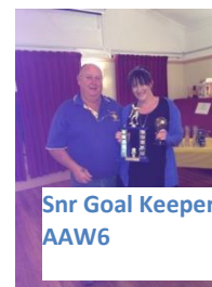
Snr Goal Keeper AAW6