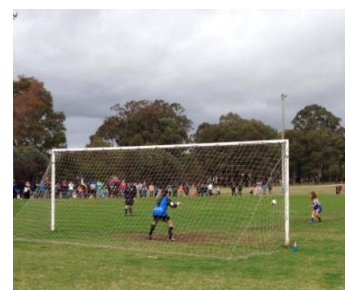
12G2 penalty shootout